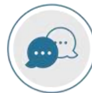
COMMUNICATION & MARKETING

To attain the certificate an applicant must complete 17 required in-person courses. All in-person courses will be 3 hours in-length. Anyone with less than five years' experience as a food service director is also required to attend the Introduction to School Nutrition Leadership offered by the Indiana Department of Education. Whenever possible multiple in-person required courses are given on the same day or in conjunction with